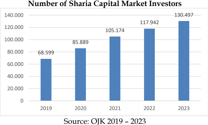
Figure 1 Number of Sharia Capital Market Investors

Based on Figure 1, the single investor identification data shows an increase in individuals entering the Indonesian capital market. Investment activities in the capital market are closely related to determining an individual's interest in investing. Investment Interest refers to a person's knowledge of an object, topic, or circumstance that is relevant to him. Interest is a function of the soul to be able to achieve something which is an internal force and appears externally as a movement (Fathmaningrum & Utami, 2022).